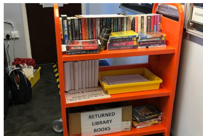
Library trolley for a 'click and collect' service