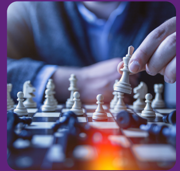
Play board games/puzzles