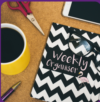
Do jobs you've been meaning to do.