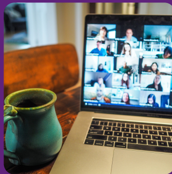
Virtual gatherings with friends