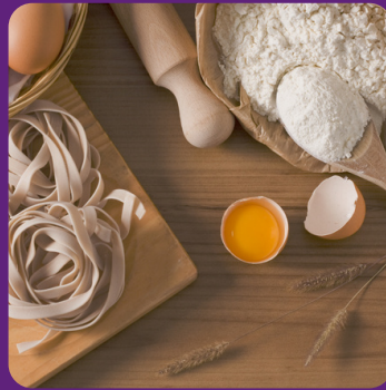
Cook / Bake