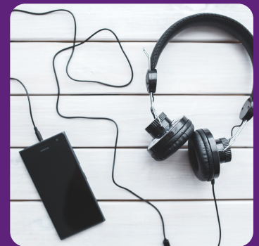
Listen to music