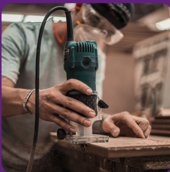
Learn a craft on YouTube – knitting, crocheting, needle felting, Woodwork