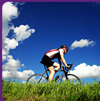
Go for a walk to a local park or bike ride