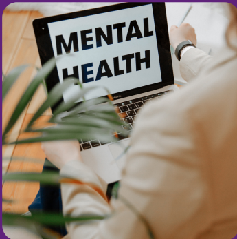
Mental Health printable & apps